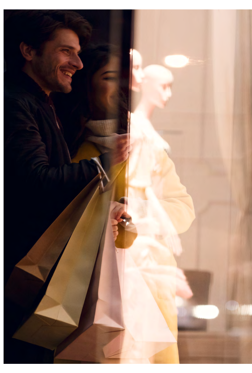
Subject to technical changes, improvements and printing errors 202450